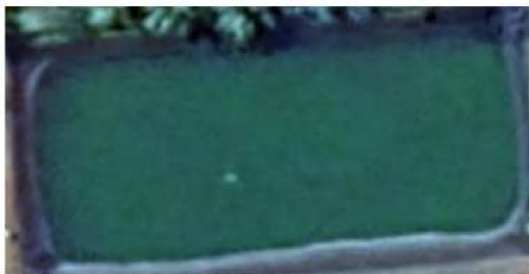
Figure 3. Space Allocated for Farm Pond 1