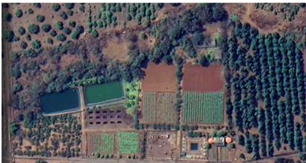
Figure 1. Location of SWCE Watershed allocation of space measurement on Google Earth Pro

When number of points are lower than there's advanced delicacy in area results is observed and vice versa, as number of points increases. Google Earth Pro shows measured area is lower