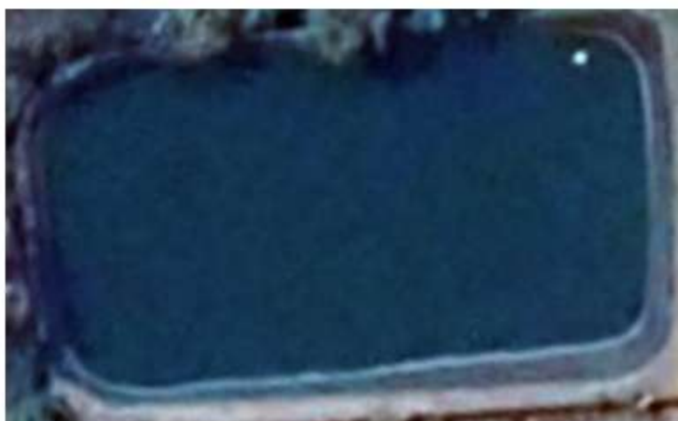
Figure 4. Space Allocated for Farm Pond 2