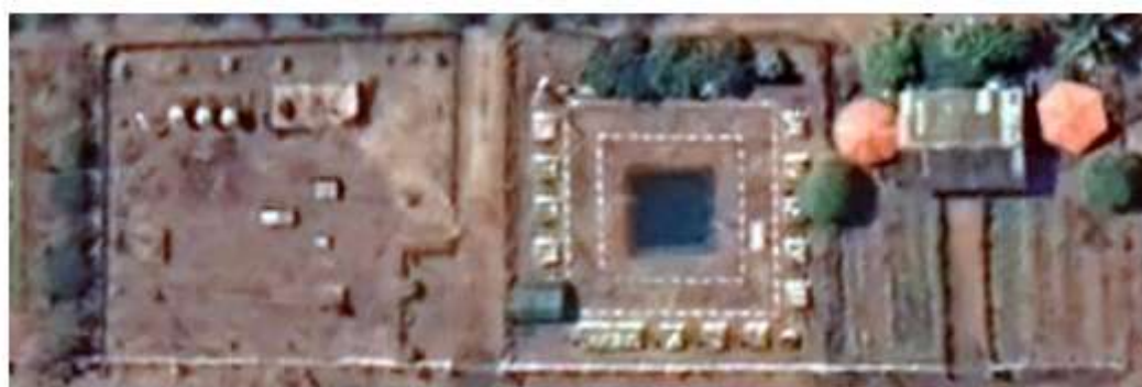
Figure 6. Space Allocated for Demo Area