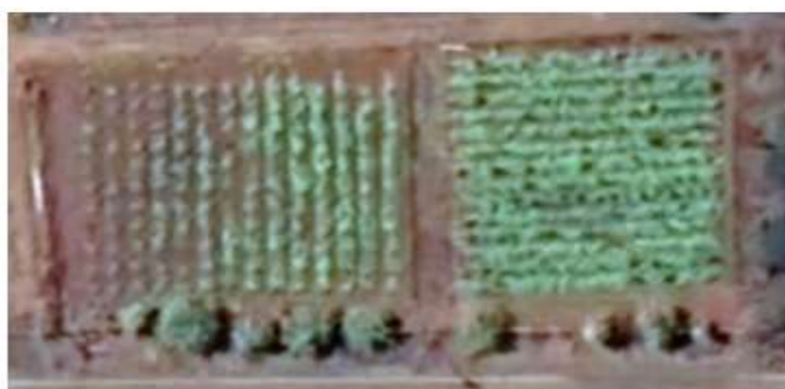
Figure 5. Space Allocated for Watermelon Plantation